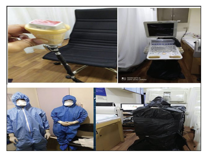
Fig. 1 Depicting use of PPE by echocardiography providers, and safety measures for echo equipment.