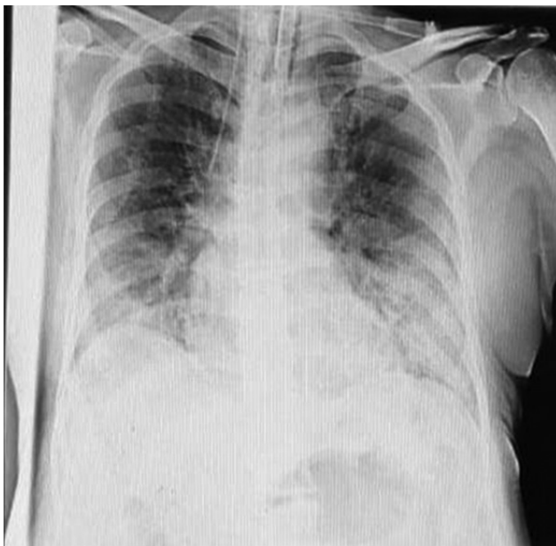
Fig. 2 X-ray of COVID-19 positive case.