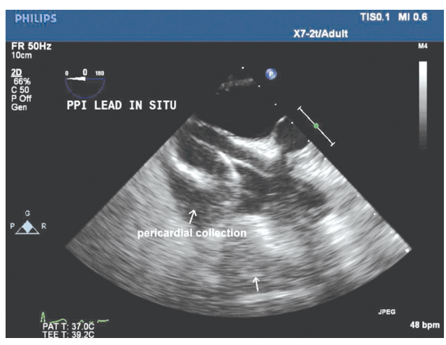
Fig. 2 Midesophageal 4-chamber view showing multiple pacing wires and pericardial collection.