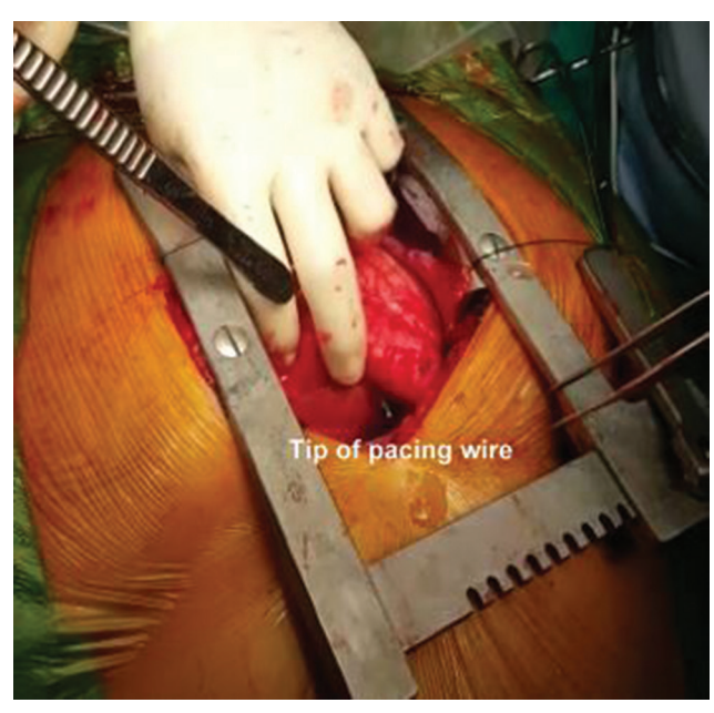
Fig. 3 After pericardial opening pacing, wire was found to be perforating right ventricle (RV).

Cardiac perforation can affect any part that comes in contact with lead. Perforation through RV apex is common, life-threatening, and requires surgical assistance. Chest X-ray and echocardiography are the useful tools for diagnosis. Echocardiography also quantitates the pericardial effusion