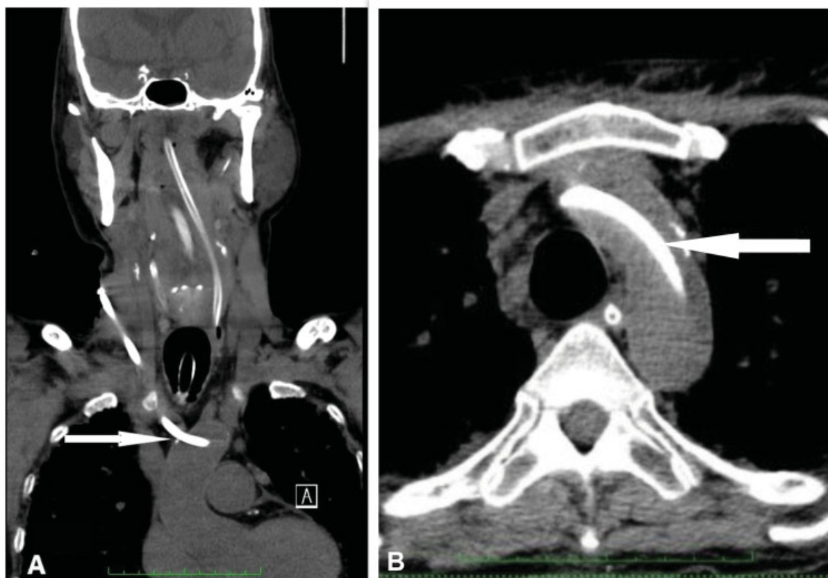
Fig. 2 (A) Computed tomography angiogram (CTA) showing hemodialysis catheter coursing from the right side of the neck into the brachiocephalic trunk and the aortic arch (arrow). (B) Hemodialysis catheter lying in the aorta (arrow).

We assume that ultrasonographic confirmation of the guidewire in the proximal segment of the vein does not always exclude accidental arterial cannulation and, in fact, may impart a false sense of security. Sometimes, the needle can move into the artery during insertion of the guidewire. If an