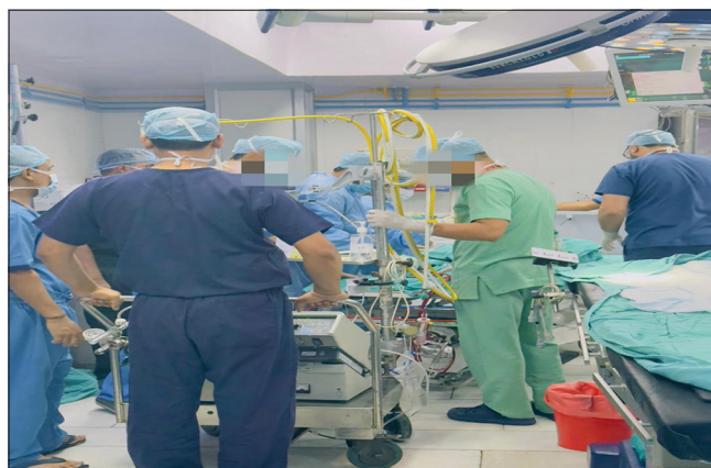
Figure 3: Transportation of patient on extracorporeal membrane oxygenation.

can assist with early detection through critical thinking, performing frequent assessments, and reporting them through an open dialog with the team of providers involved.