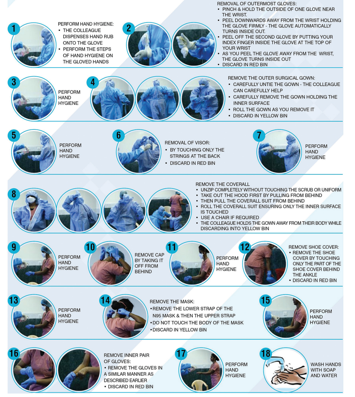
Fig. 2 Doffing of personal protective equipment (PPE).