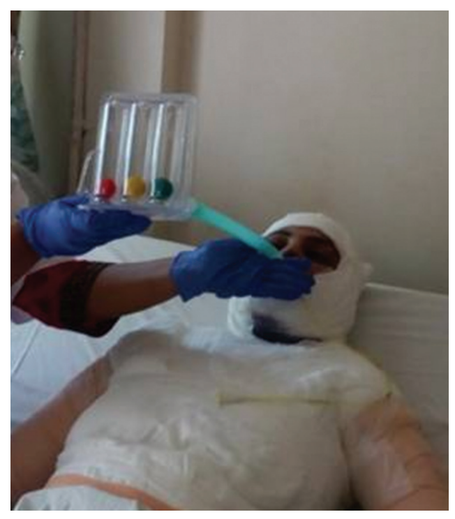
Fig. 5 Spirometry breathing exercises.