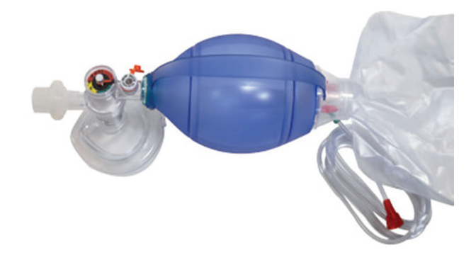
Fig. 4 Ambu bag used for manual hyperinflation in intensive care unit.

This is used in conscious patient for extremity pain management. Small trials recorded benefits for muscular strengthening and muscle mass.<sup>37</sup>