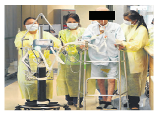
Fig. 2 Mobilization (standing and walking) with walking aid in intensive care unit.

Due to inactivity, inflammation in patients in ICU presents with muscular weakness. Pain treatment and management devices such as endotracheal tube, catheters, and thoracotomy tubes further contribute to muscular weakness or disuse atrophy. It involves changing position hourly or frequently in conscious or unconscious patients. Only shortterm effects are available for positioning. Evidences are available for selecting appropriate treatment and suitable patient for mobilization. Early mobilization is helpful in sitting, standing, and walking with assistive aids ( -Fig. 2 ). Sitting, standing, and walking with aids increases gaseous exchange while prolonged bedrest increases the risk of deep vein thrombosis, improve chest wall strength, gaseous exchange and functional residual capacities.<sup>26-28</sup>