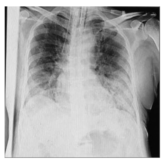
Fig. 2 X-ray of COVID-19 positive case.