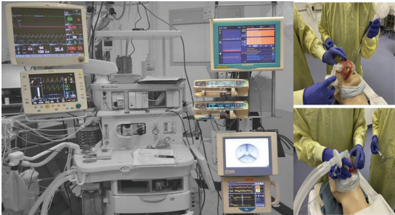
Fig. 3 An array of TIVA infusion pumps with the anaesthesia machine and monitors using intubations and for safe extubation too!