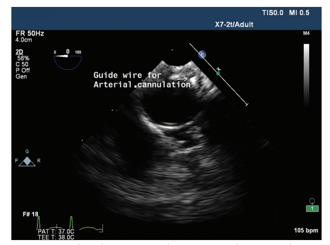
Fig. 4 Descending thoracic aorta short axis view showing guide wire.