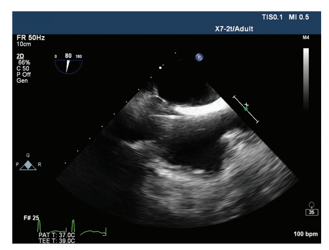
Fig. 2 Mid oesophageal bicaval view showing guide wire in right atrium.

mandatory ventilation (SIMV) mode with tidal volume 200 mL, respiratory rate10 breaths/min, positive end-expiratory pressure 7 mm Hg, and Fio<sub>2</sub> 35%. She was supported with VA ECMO for 5 days, and vasopressors and inotropes were gradually weaned with ongoing VA ECMO support. Her laboratory values were shown in - Table 1 . On fifth day, she was successfully weaned from VA ECMO and decannulated. The following day, she was weaned from ventilator and extubated. She was discharged on 12th day, and follow-up after 2 months showed favorable outcome.