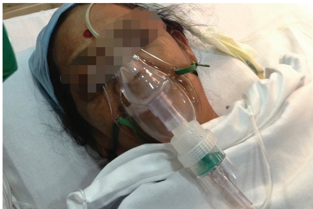
Fig. 2 Patient that underwent successful off pump coronary artery bypass (OPCAB) surgery under total intravenous anesthesia (TIVA) with ProSeal laryngeal mask airway (PLMA).