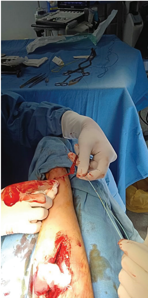
Fig. 1 Right radial artery exploration distally found congregation of radial artery and subcutaneous tissue around catheter