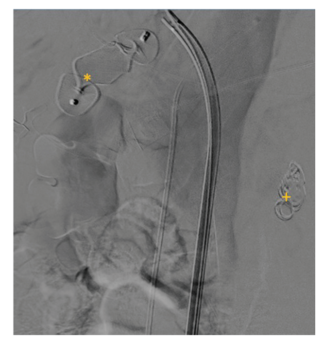
Fig. 3 Check digital subtraction angiography showing coils (+) and plug (*) in distal and proximal portion of splenic artery, respectively, with complete exclusion of pseudoaneurysm.

The distal splenic artery was selectively catheterized distal to the pseudoaneurysm and was embolized using multiple micro coils, followed by deployment of Amplatzer