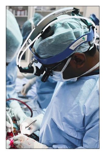
Figure 2: Cardiac surgeon in surgical attire, wearing vascular loupes and headlight.

was not well received because of its heavy weight. In 1912, Moritz Von Rohr of Jena fashioned a much lighter loupe, which would be manufactured by Carl Zeiss, Inc. and gained popularity despite having low magnification.[1]