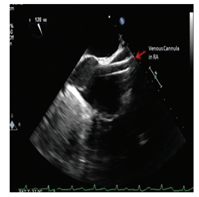
Fig. 5 Transesophageal echocardiography mid-esophageal bicaval view—SVC cannulation with tip of the guidewire visualized in RA.

If the endoaortic balloon occlusion system is planned, TEE is further used to verify final balloon position ~2 cm above the aortic root. Passage of a guidewire from the femoral vein during