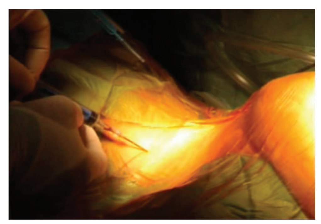
Fig. 3 SVC cannulation.

External defibrillator pads should be applied before the induction of anesthesia. Right coronary artery bypass by right minithoracotomy approach has been associated with bradycardia and atrioventricular conduction blocks; placement of pacing leads through the PAC should be considered.