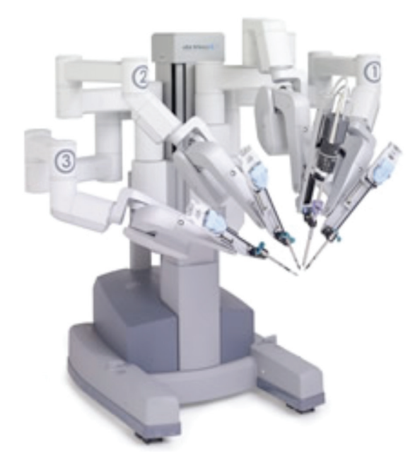
Fig. 1 Da Vinci robotic system.

team. The anesthesiologist must be skilled in numerous subspecialty skillsets including regional anesthesia and analgesia techniques, elements of thoracic anesthesia practice, in particular, one-lung ventilation (OLV), cardiac anesthesia, and transesophageal echocardiography (TEE). This review focuses on anesthetic considerations in MICS.